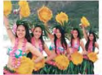
The Hawaiian Pacific Magic September 1