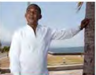
Ken Boothe August 21