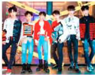
BOY STORY August 27