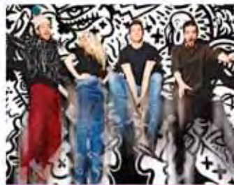
Walk Off The Earth August 31