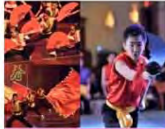
Shaolin Luohan Temple August 31