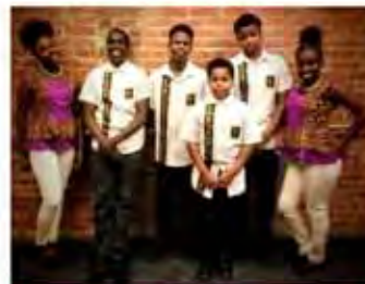
Ngoma Ensemble August 21