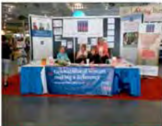
CNEA Membership Exhibit