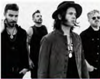
Rival Sons August 19