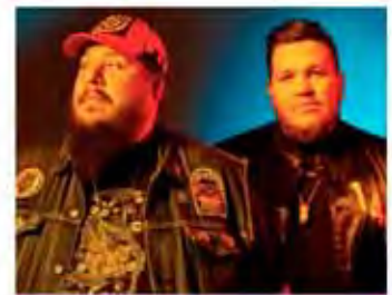
A Tribe Called Red September 1