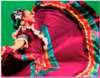
Ballet Folklorico Puro Mexico August 24