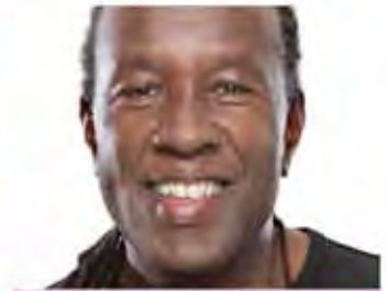
David Rudder and The Contraband August 28