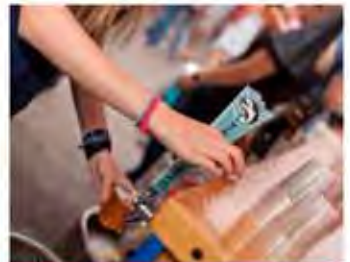
Craft Beer Fest August 22 to 26