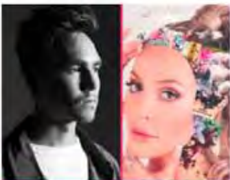
Tyler Shaw and Delaney Jane August 22