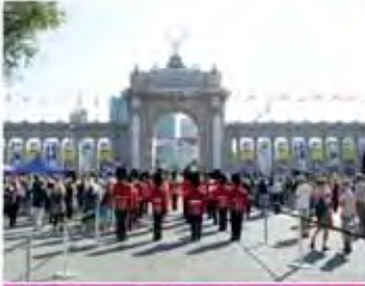
Opening Ceremonies August 16