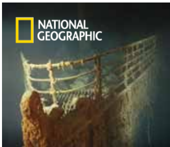
50 Greatest Photographs of National Geographic*

All Concerts & Events FREE with Admission to the CNE!