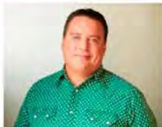
The World According to Canada Comedy Night August 29