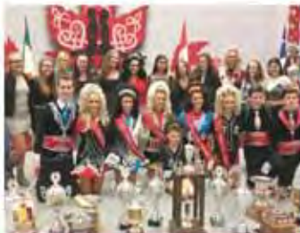
The Butler-Fearon- O'Connor School of Irish Dance August 19