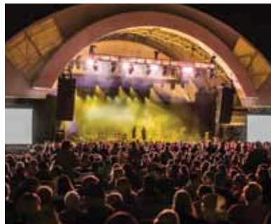
CNE Bandshell Concert Series

Augmented Reality Experience at Legends of the Silk Road Come to Light!