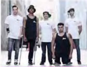
ILL-ABILITIES Dance Crew August 16-25