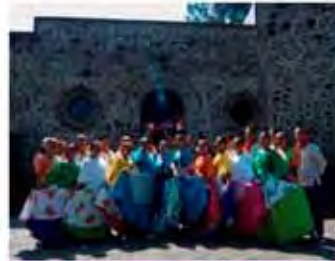
Folklorico Filipino August 18