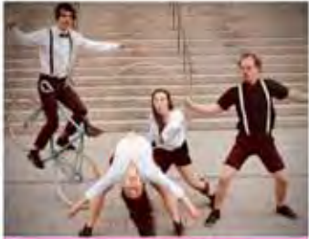
"Nous Autres" – Cirque Creation by Événements M2C August 26 to 30