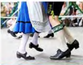
Oktoberfest August 29 to September 2