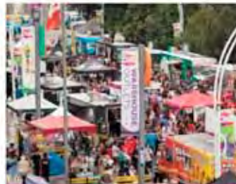
Food Truck Frenzy August 22 to 26