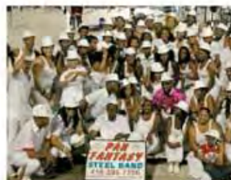
Pan Fantasy August 22