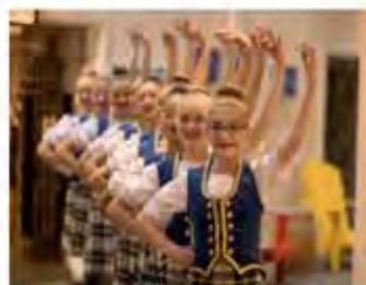
Amethyst Scottish Dancers of Nova Scotia August 22-24