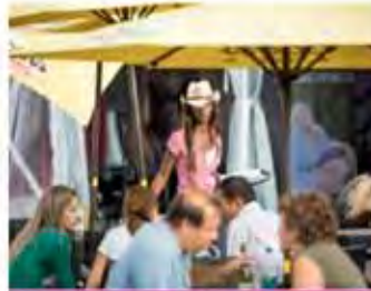
Northern Comfort Saloon