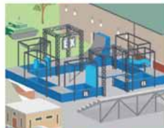
The Ex Race: Extreme Sports Competition