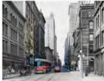
About Time: Harry Enchin Photography