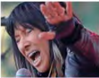
Buffy Sainte-Marie August 26