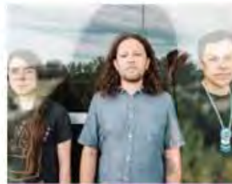
nêhiyawak Opening for A Tribe Called Red September 1