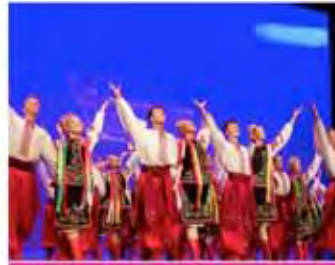
The "Ukraina" Dance Ensemble August 25