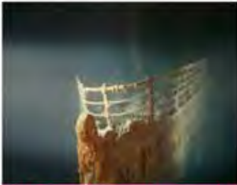
50 Greatest Photographs of National Geographic