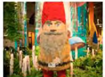
Nook of Gnomes