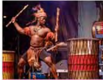
Kalabante August 26 to September 2