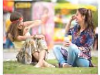
CNE Woodstock Weekend August 17 & 18