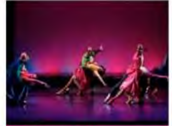
City Dance Corps August 17