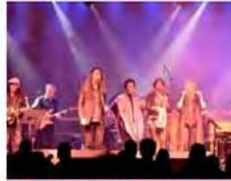
Woodstock Weekend August 17 & 18