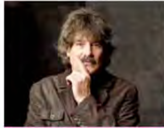
Burton Cummings & Band August 16