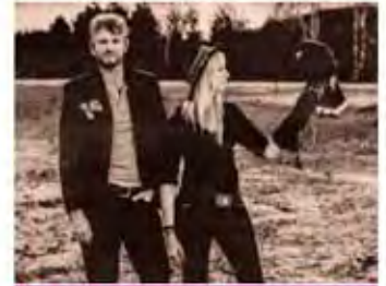
The Standstills Opening for Rival Sons August 19