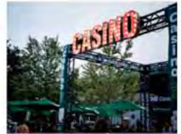
Casino Patio & Stage