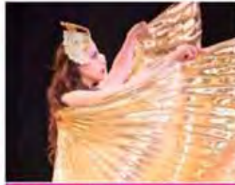
The Egyptian Dance Academy August 24