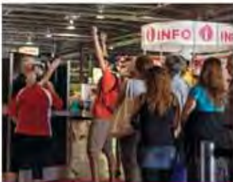
Food Products Day August 21