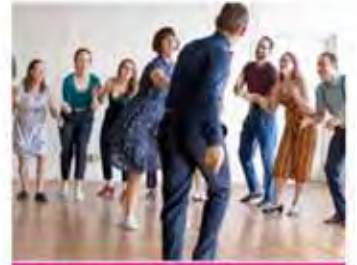
Lindy Hop Revolution August 25