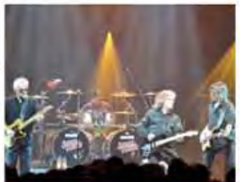
April Wine August 23