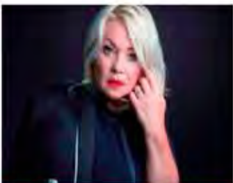
Jann Arden August 24