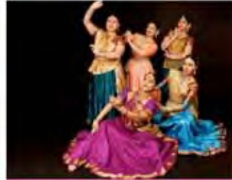
Panwar Music and Dance Productions August 16