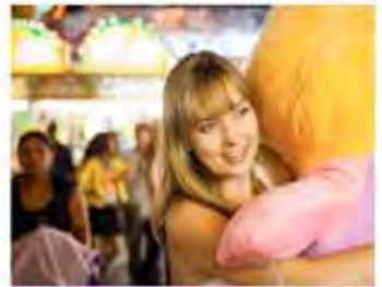
$9 Nights August 19-22 & August 26-29