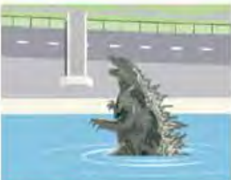
Chill with Zilla