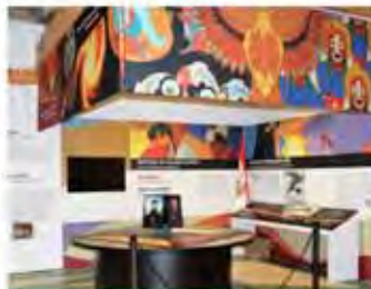
The Mississaugas of the Credit First Nation Exhibit