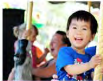
Kids Toonie Mondays August 19 & 26