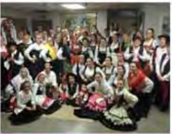
Arsenal do Minho September 1