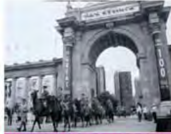
Warriors' Day Parade August 17