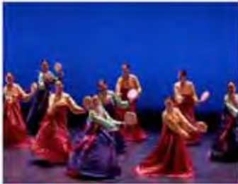
The Korean Dance Studies Society of Canada August 17