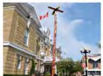
The Unity Pole