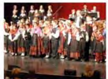
Mladi Glas & Planika August 23