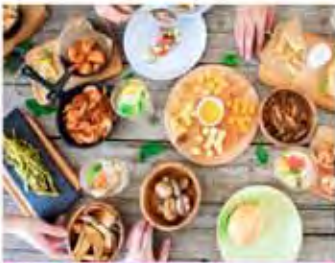
East Coast Kitchen Party August 17 to 20