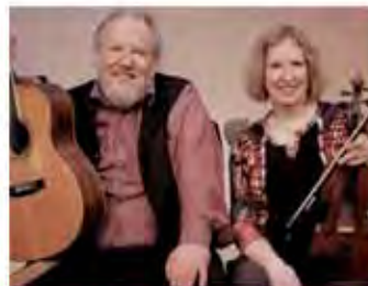
Cross-Canada Fiddle Cavalcade August 20