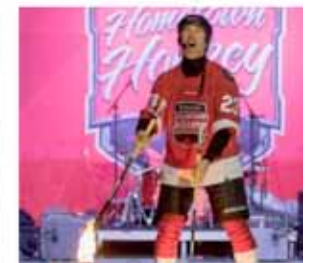
The Hockey Circus Show