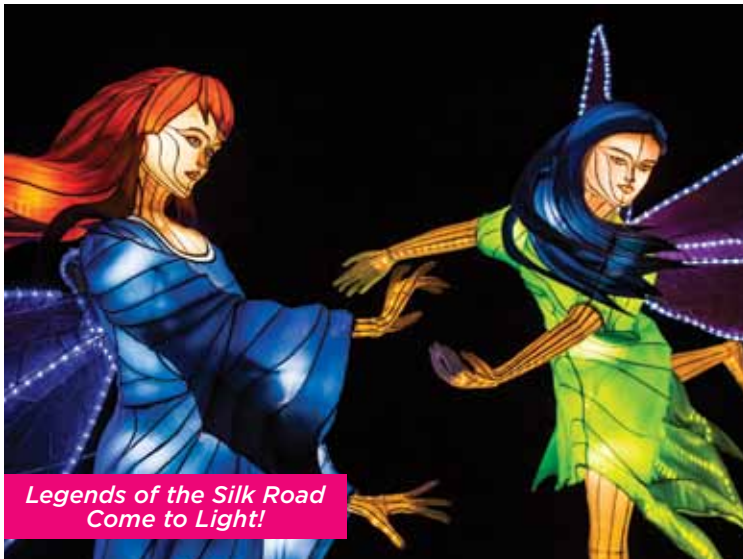
Legends of the Silk Road Come to Light!

To learn more about our Special Ticket DISCOUNTS & OFFERS