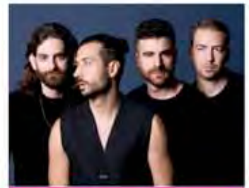
MAGIC! August 30