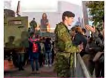
Canadian Armed Forces Interactive Area