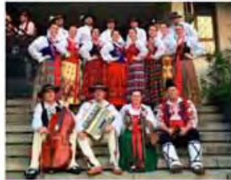
Harnasie August 18