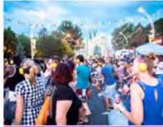
Silent Disco August 16 to September 1