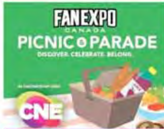
FAN EXPO Picnic and Parade August 19