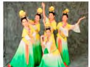
The Orient Dance Company August 20