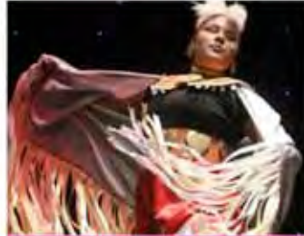
White Pine Dancers August 16