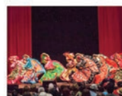
Ballet Folklorico Puro Mexico August 24