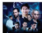
Cascade August 22 to September 3