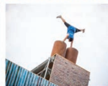
RUSH: Parkour Competitive Demonstrations