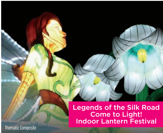
Legends of the Silk Road Come to Light! Indoor Lantern Festival

OPENS AUGUST 17 ALL EVENTS FREE WITH ADMISSION!†