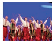
The "Ukraina" Dance Ensemble August 19