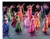
Arabesque August 18