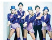
Toronto Dance Life August 20