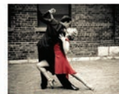
Tango Soul August 20