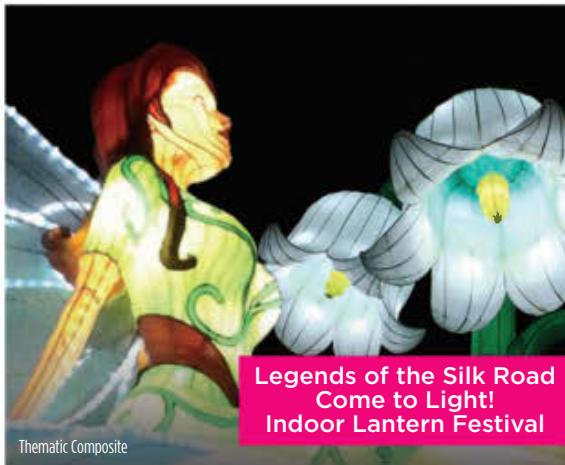
Legends of the Silk Road Come to Light! Indoor Lantern Festival