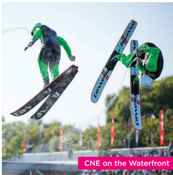
CNE on the Waterfront