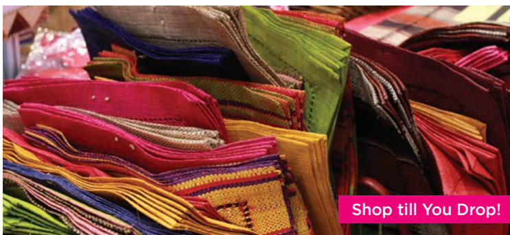
Shop till You Drop!