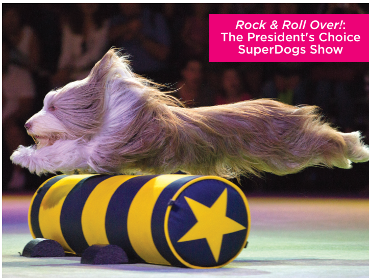
Rock & Roll Over! The President's Choice SuperDogs Show

OPENS AUG 19 ALL EVENTS FREE WITH ADMISSION!†