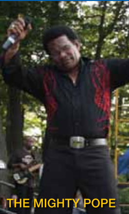
THE MIGHTY POPE