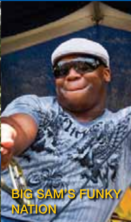
BIG SAM'S FUNKY NATION